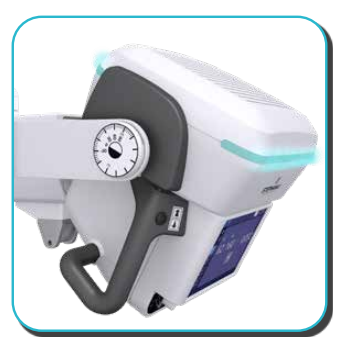
Collimator Rotation : +/-90°

Movix DReamy rear diameter load wheels, as well as front steering wheels featuring shock absorbing springs help tp cross obstacles such as elevator threshold.