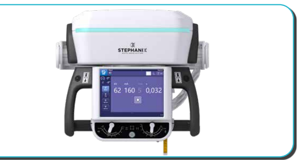
Tube Vertical Rotation : +/- 180° Mobile's movements on the tube head: Easier and faster positioning at patient's side without the need to return to the drive handle.