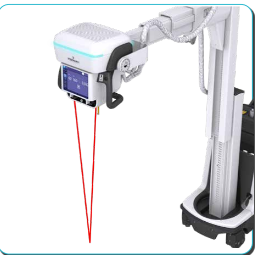
LED light field and focus laser