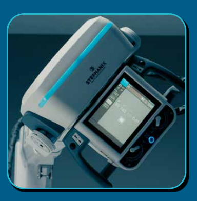
STATUS INDICATORS LIGHTS Color Coded Leds indicate the status of your Movix DReamy.

The safety bumper located on the mobile as soon as it collides with an obstacle.